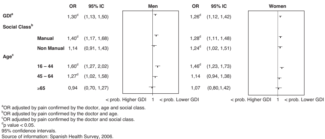
Fig. 3. Probability of analgesic prescription in women and men living in regions with lower Gender Development Index compared with women and men living in areas of higher Gender Development Index, independently of pain confirmed by the doctor, age and occupation types.

Given that the questions specifically referred to the two weeks prior to our survey, there was less probability of memory bias regarding analgesic prescription, although self-reporting bias remained a possibility. Nevertheless, the frequency of analgesic prescription would have been even higher if the question had referred to the previous 12 months, as in the case of pain. 26 When interpreting the results, we did not consider the interval between the questions regarding analgesic prescription and pain diagnosed by a doctor, and thus can only assume that the prescription was in fact related to the pain diagnosed 12 months previously, as these questions enquired about chronic pain. A similar situation arises as regards consultation with a general practitioner or a specialist, as we do not know whether or not said consultation was related