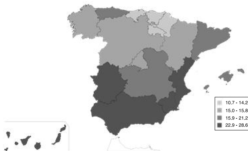
Figure 1. Distribution of unemployment in Spain's autonomous regions according to quartiles of the 2010 unemployment rate. Data source: National Institute of Statistics, Spain.