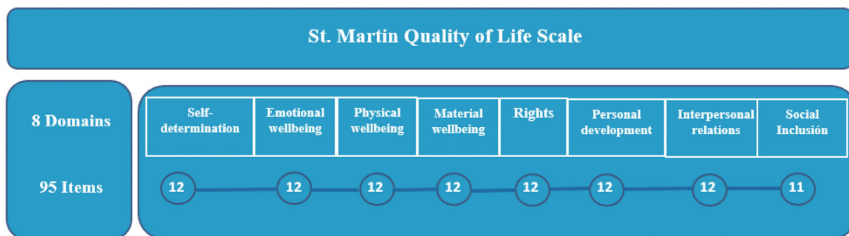
Figure 1. Structure of the San Martin Scale, showing the breakdown into eight domains and ninety-five items. The items are related in each dimension. All dimensions have 12 items, except for the social inclusion domain, which has 11 items. Own elaboration, based on the Scale Manual 26 (see Supplementary material).

When the San Martin Scale is administered to an individual, the responses that the individual has given per question (item) are obtained. By adding the responses for each item, the total direct scores for each dimension are obtained. Having the total direct scores of the dimensions, these are transformed into standard scores, using Table A in Annex A of the San Martin Scale manual 26 . Once having the standard scores for each dimension in on are obtained, they are summed up to obtain the total standard score. This total standard score is converted to a QoLI using Table